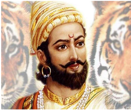
Chhatrapati Shivaji Maharaj

He died in 1680, and was succeeded by his son Sambhaji, who, in turn, was taken prisoner and executed by Aurangzeb, in 1689. Power then passed into the hands of a series of prime ministers, who ruled under the title Peshwa. Balaji Vishwanath (1713 to 1721), Bajirao Peshwa I (1721 to 1740), Balaji Bajirao (1740 to 1761), Madhav Rao (1761 to 1772), Narayanrao Peshwa (1772 to 1773) were the leading Peshwas.